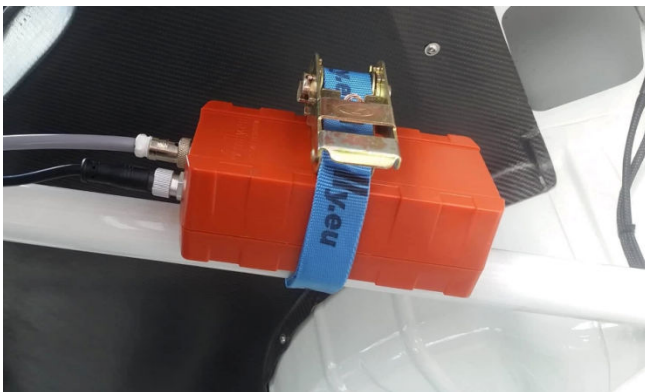
Receiver / Transmitter Unit

The receiver / transmitter unit is fixed to a bar of the roll cage in the rear of the car (using a small ratchet strap which is supplied) and the console is mounted in the centre front of the car such that both crew members can, both see and reach it, while belted in their seats . The connecting cable is then ran to the receiver / transmitter unit in the rear of the car, generally being cable tied ( cable ties not supplied ) to the bars of the roll cage. In routing the cable, care should be taken to ensure that the cable is fixed to the inside of the roll cage bars in order that it is not damaged in the event of an accident where the body panels are pushed against the roll cage.