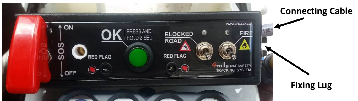
User Console – in reach of both crew members