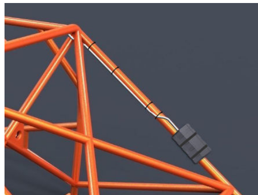
Connecting Cable – routed on inside of roll cage in order to avoid damage in event of car rolling etc.